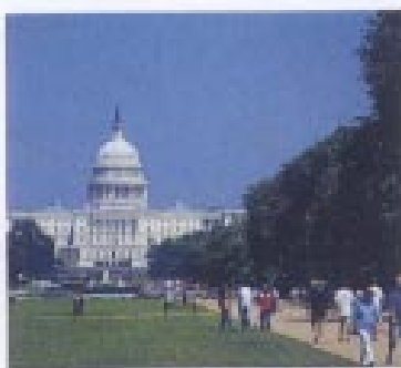
The elegant Capitol Building, Washington

surveyor in his early career, and which was bought by Thomas Jefferson from the British Crown in 1774.