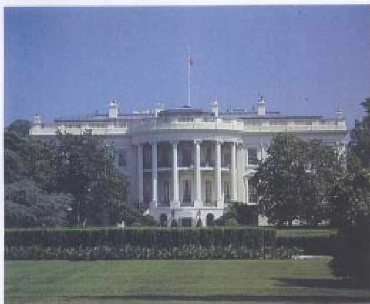
See the White House on our tour of Washington

This morning we take the short bus ride from the hotel to the Natural Bridge, surveyed by George Washington who was a professional