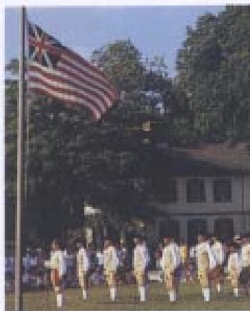
See history come alive in Williamsburg

The city of Washington, located at the confluence of the Potomac and Anacostia Rivers, was built at the end of the 18th century to a design by Major Pierre Charles L'Enfant. The design, based on that at Versailles, allowed for grand avenues, decorative features and plenty of open space. We see the elegance of L'Enfant's creation during our half-day city tour which takes in the major sites including the White House - official residence of the US President, the domed Capitol building and the impressive Lincoln Memorial. We pause at