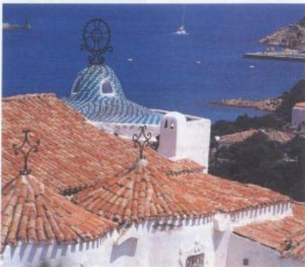
Join us on the northern shores of Sardinia

Please see pages 179 - 181 for details of items not included in the holiday price and our price policy. ITA