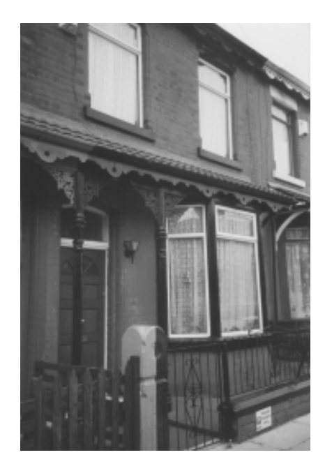
Can you remember the first time you went to the Blue Coat?

Came on the bus with me mother – I can still remember that – from the Swan where we lived. There were about six of us going in and we went