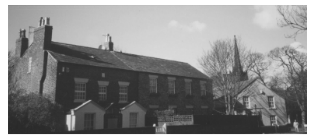
Oak House, Knotty Ash, with St John's Church in the distance.