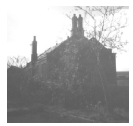
Knotty Ash Infants School, Thomas Lane

Oh yes, I can remember playing in that playground many a time.