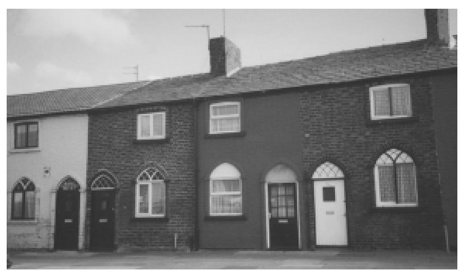
Prescot Road, Knotty Ash